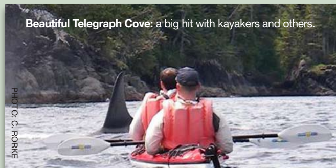
Beautiful Telegraph Cove: a big hit with kayakers and others.

The 70,000 visitors who journey to Telegraph Cove — the top tourist attraction on northern Vancouver Island — are grateful that a 20-year effort has finally paid off. Government, industry and local businesses worked together to upgrade Shephard's Way, the 5.6-km road to the cove. The provincial government and owners of Telegraph Cove Resort and Telegraph Cove Marina paid for the $2-million upgrade. TimberWest and Western Forest Products (formerly Canfor), who own the road, agreed to cede rights-of-way. "The old road would be full of potholes when it rained and dusty when it was dry, so it's made a big change," says Telegraph Cove Resort owner, Gordie Graham. "Travellers from previous years will be pleasantly surprised to see the change. It will have a more positive impact in the years to come as people realize the scenic drive is all smooth sailing." The road is named for former regional district chair Bill Shephard, who passed away last November.